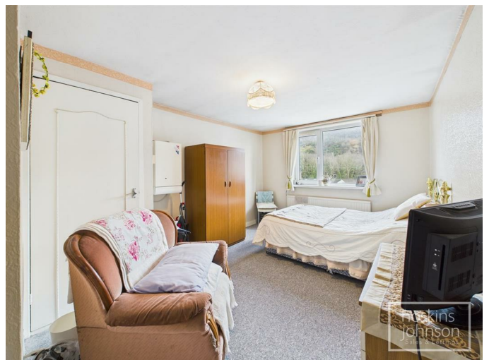
Bedroom 1 12'11" x 10'1" (3.96 x 3.08)

Double glazed window to rear, radiator, wall mounted gas boiler and airing cupboard.