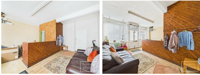
Front Shop Area 15'11" x 12'10" (4.87 x 3.93)

Glazed entrance doors and windows to front, storage cupboard.