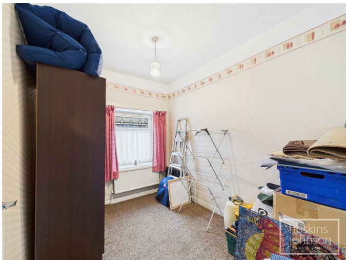
Bedroom 4 9'4" x 7'2" (2.87 x 2.19)

Double glazed window to front, radiator.