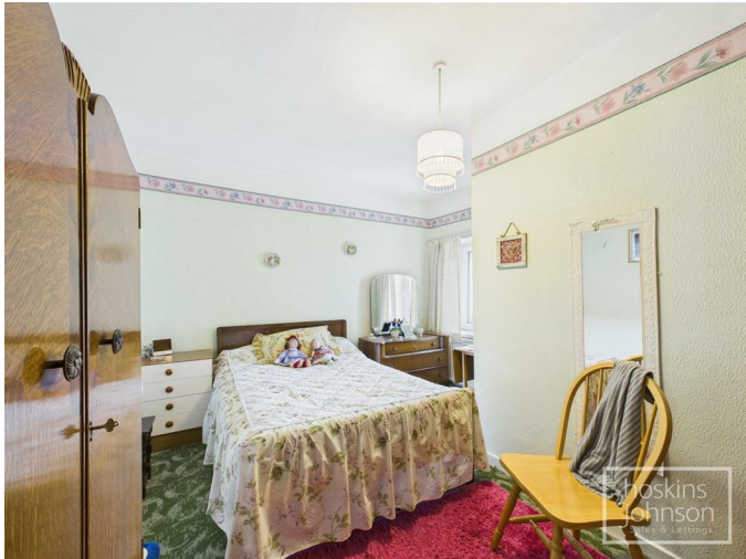
Bedroom 3 12'11" x 7'11" (3.95 x 2.43)

Double glazed window to front, radiator.