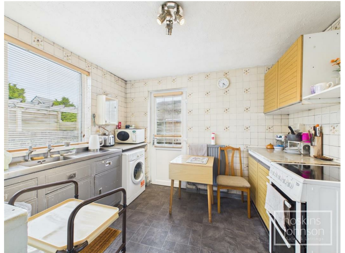
Kitchen 10'1" x 7'11" (3.09 x 2.43)

Base and wall cupboards, stainless steel sink unit, electric cooker point, space for washing machine, radiator, double glazed window to side, half glazed door to rear.