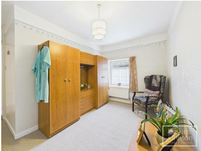
Bedroom 2 12'5" x 8'3" (3.79 x 2.54)

Double glazed window to front, radiator.